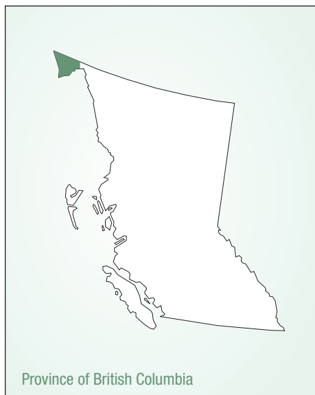
Province of British Columbia