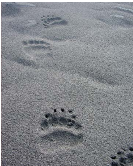
Grizzly bear tracks on a Tatshenshini River sandbar, BC.