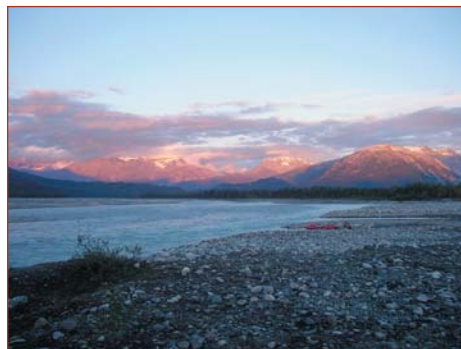
Evening at an Alsek River campsite, BC